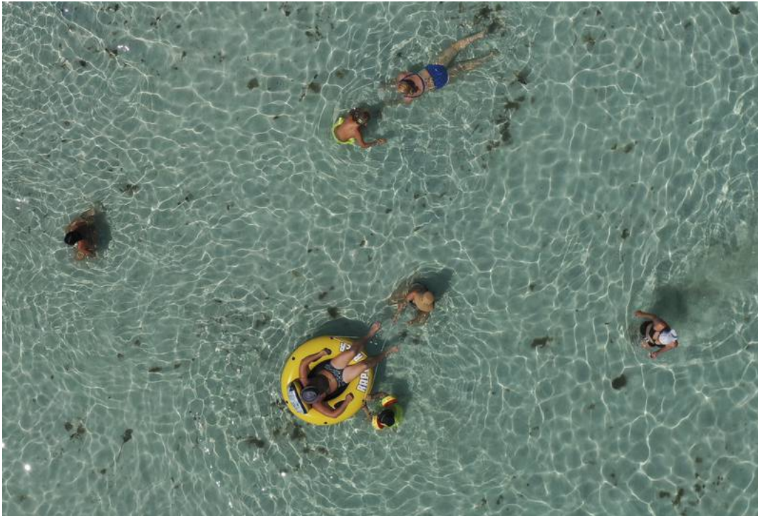
10. Cyprus.

*Top countries for UK travellers for economy return travel booked on Skyscanner in January 2022 for travel in summer 2022 (June, July and August 2022)