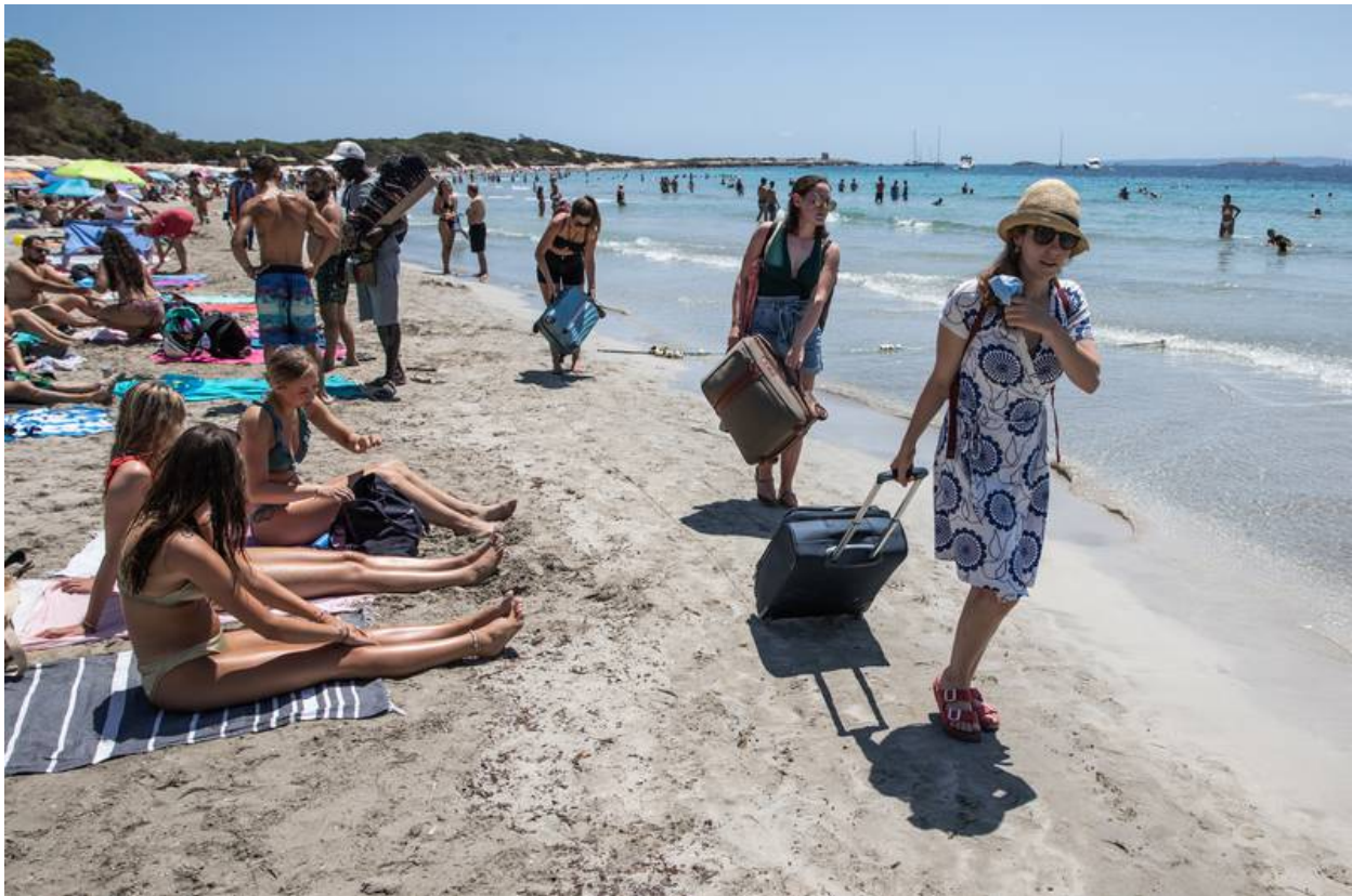
Unvaccinated travellers to Ibiza, Spain, must self-isolate for up to 10 days upon return to the UK.

► The prospect of avoiding travel restrictions will act as inducement to be jabbed, says leading behavioural expert